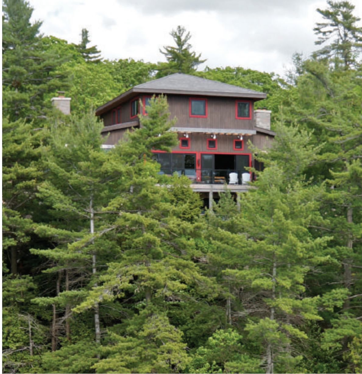
The boathouse (right and above) is located away from the cottage (top right), turning it into a separate location within the eight acre property.