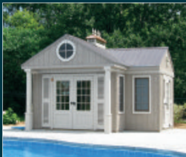
GLASS HOUSES ♦ COACH HOUSES