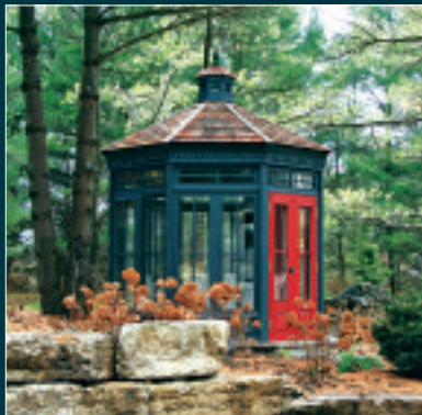
GAZEBOS ♦ CABANAS ♦ CABINS